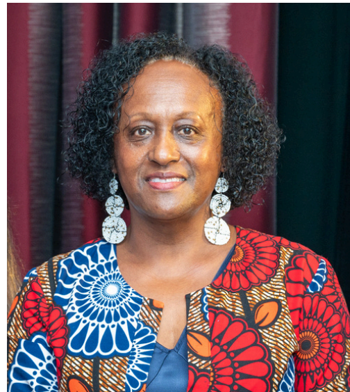
Veronica Pickering, Lord-Lieutenant of Nottinghamshire