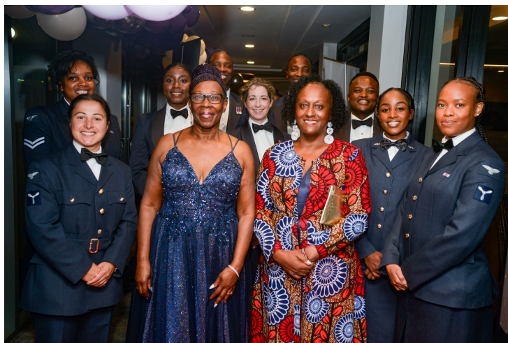
Royal Air Force