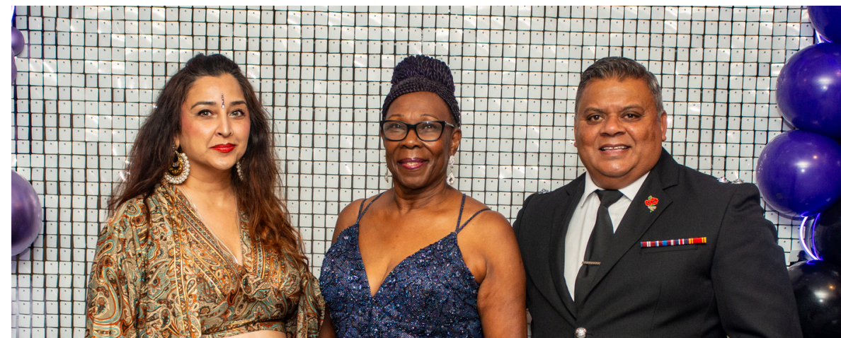
Nottinghamshire Fire and Rescue Service